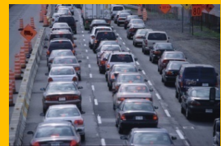
Removing emissions of 5 cars